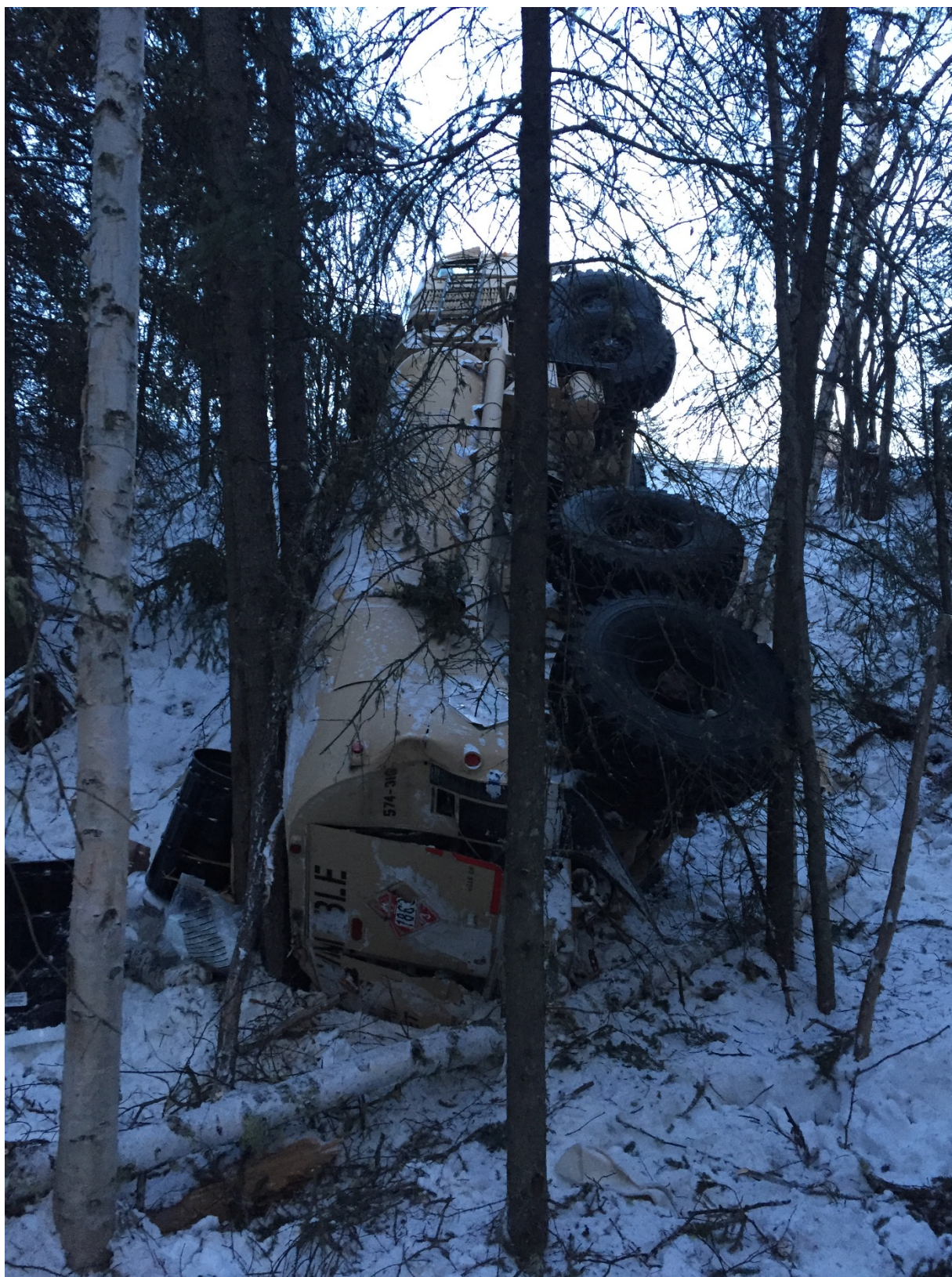
Tanker as it came to rest, March 4, 2018