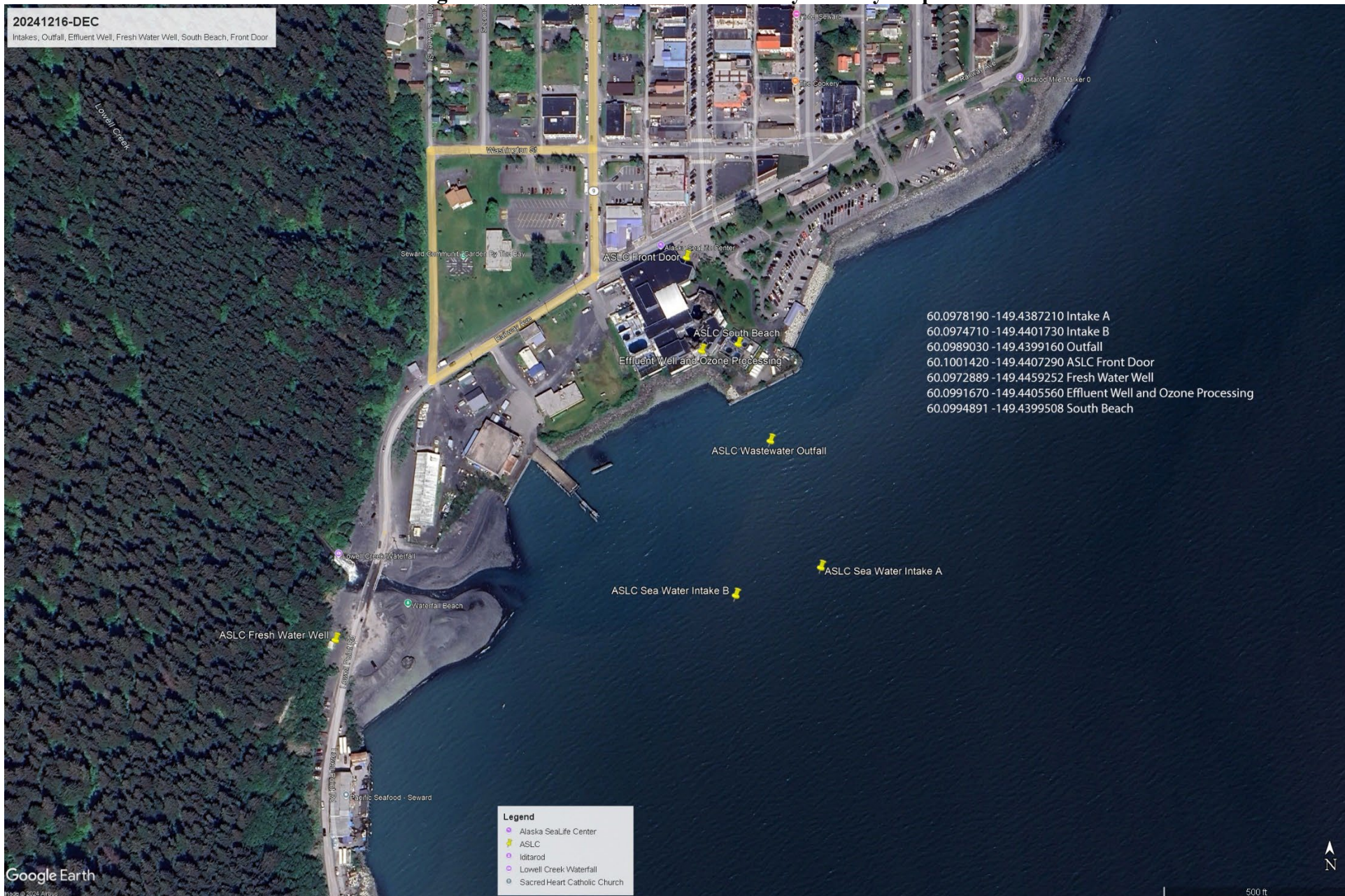
Figure 1: Alaska SeaLife Center Facility Vicinity Map