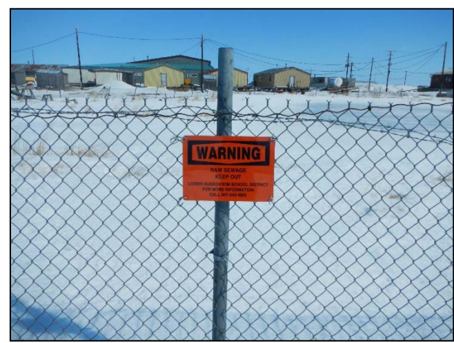
Page 2 of 2