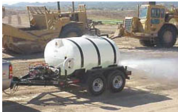
Figure 1. “Water Dog” 1,000 Gallon Rear Spray

The “Water Dog” watering system, manufactured by C & I Equipment Company, Incorporated (Tucson, Arizona, www.ciequip.com/index.html ), is presented here for example. This watering system is manufactured with different tank sizes (e.g. 325, 500, 1,000 and 2,000 gallon tanks). The “Water Dog” watering system can be purchased with a gasoline high pressure pump, electric valve to control rear spray from a towing vehicle, hose package, side spray attachment and trailer. The total costs for the “Water Dog” 500 gallon, 750 gallon and 1,000 gallon watering system with trailer and accessories are $10,155, $11,682, and $13,318 US dollars, respectively (which includes delivery to Anchorage, Alaska). A picture of the “Water Dog” 1,000 gallon watering system in Figure 1.