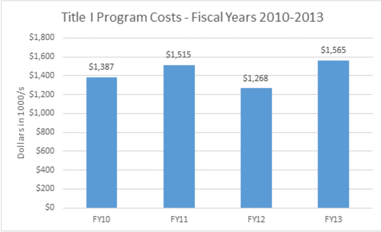
Figure 2 – Title I Prior Year's Costs – FY10 – FY13

In summary, the Program spent $5,734,281 delivering the Title I program from FY10 through FY13. From FY10 to FY13, the Title I program saw a 13% increase in costs.