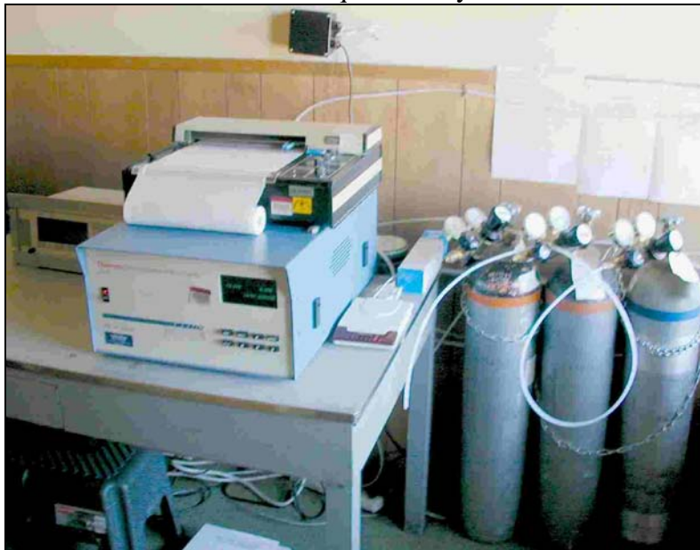
Figure III.B.4-1 TECO 48 CO Analyzer with Strip Chart Recorder and Data Acquisition System

The monitoring network is operated 24 hours a day from October 1 through March 31. Hourly averages of CO levels are provided from each station in the network. These data are uploaded to a central computer every weekday. Data are submitted to EPA on a quarterly basis for inclusion in the nationwide air quality database known as AQS. CO monitoring is conducted in conformance with guidelines established in federal regulations, EPA guidance and instrument manufacturer recommendations. Third party instrument performance audits are conducted by EPA and/or ADEC quarterly.