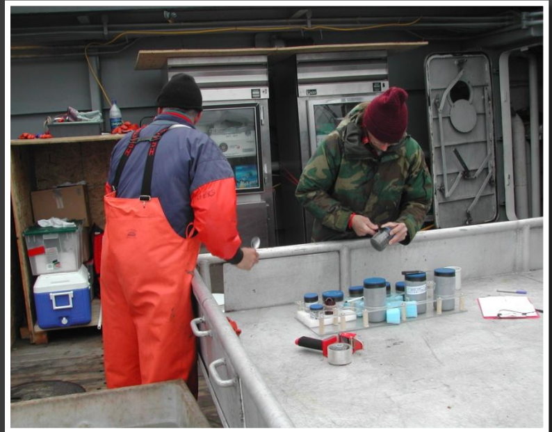
The field crew collects sediment samples with Van Veen sampler.