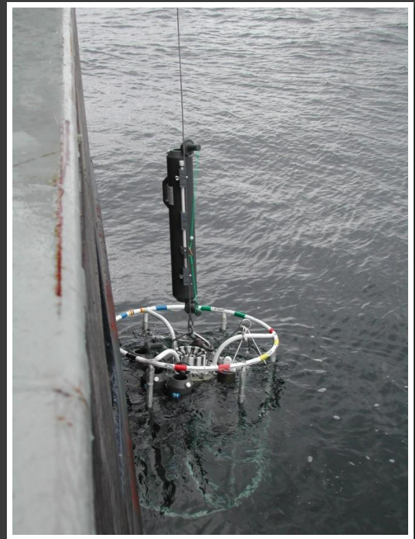
The field crew deploys the CTD and Niskin Rosette assembly.