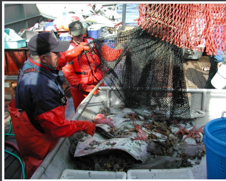
Field Crew collects and sorts trawl samples.