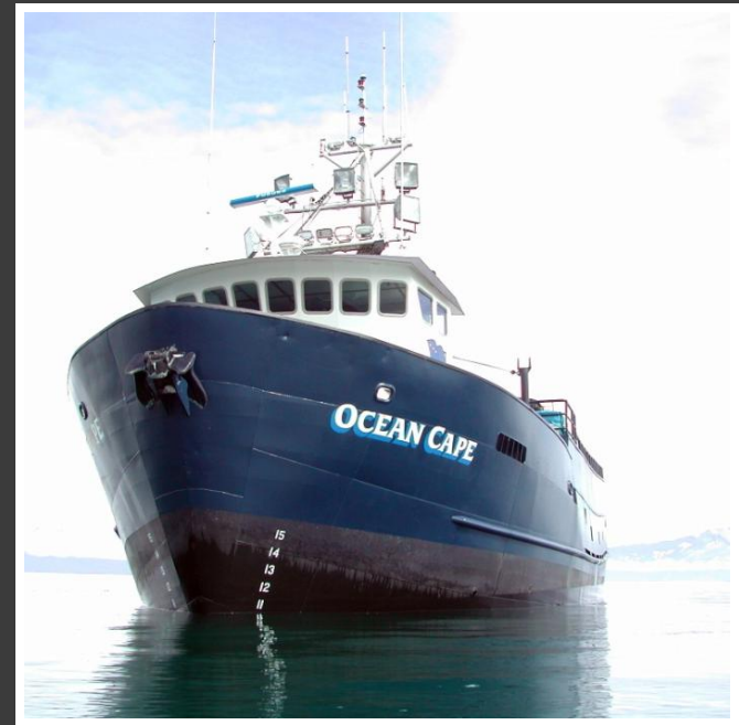
The vessel used during sampling.