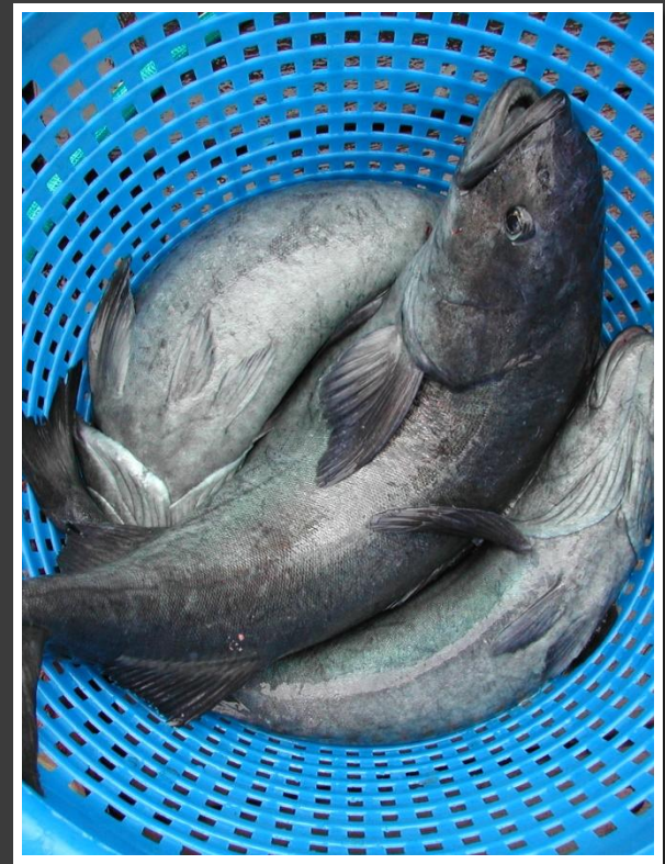
Various specimens collected through trawling. Cook Inlet Regional Citizen's Advisory Council partnered with DEC to complete this survey.