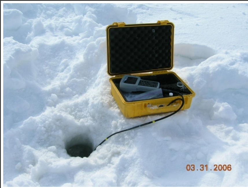
YSI Sampler used to measure in situ conditions.