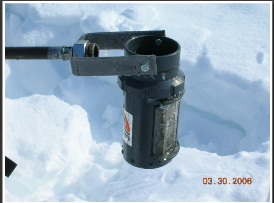
Wildco Sampler used to collect plankton and invertebrates.