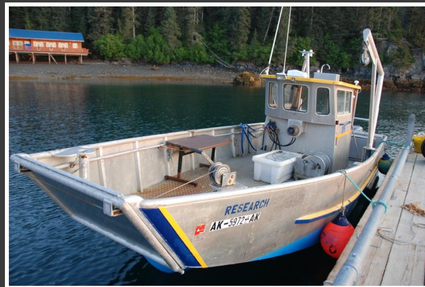
UAF vessel used during sampling.