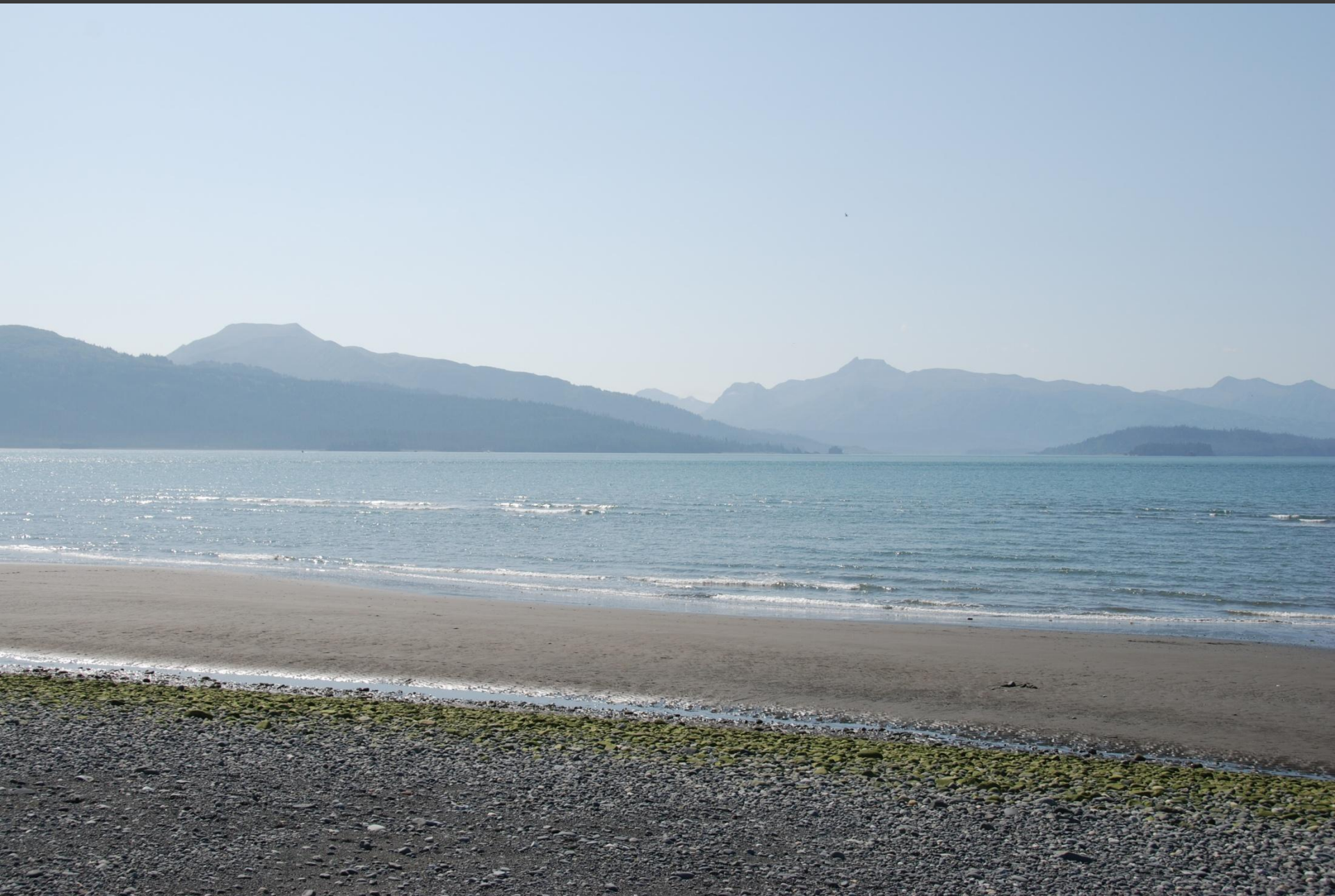
Kachemak Bay as viewed from the Homer Spit.