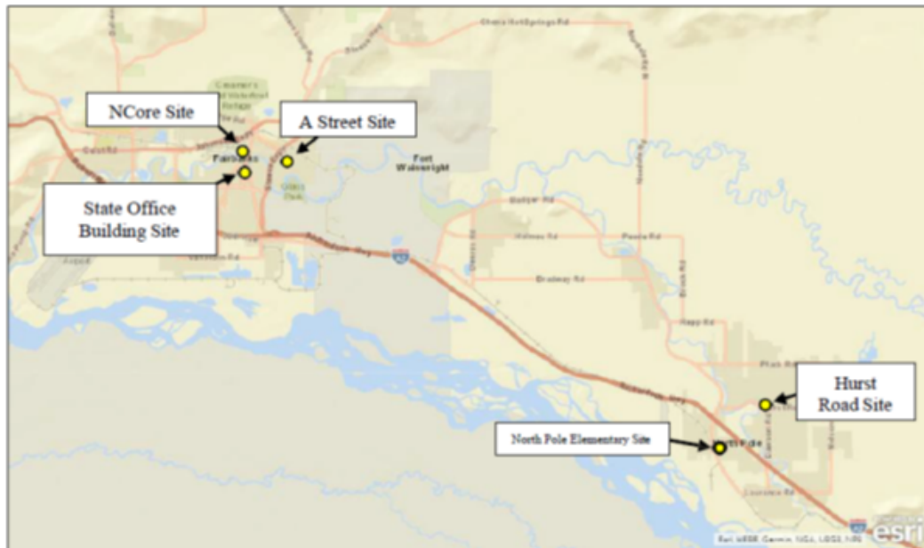
Figure 7.4-1 Locations of Fixed PM 2.5 Monitoring Sites