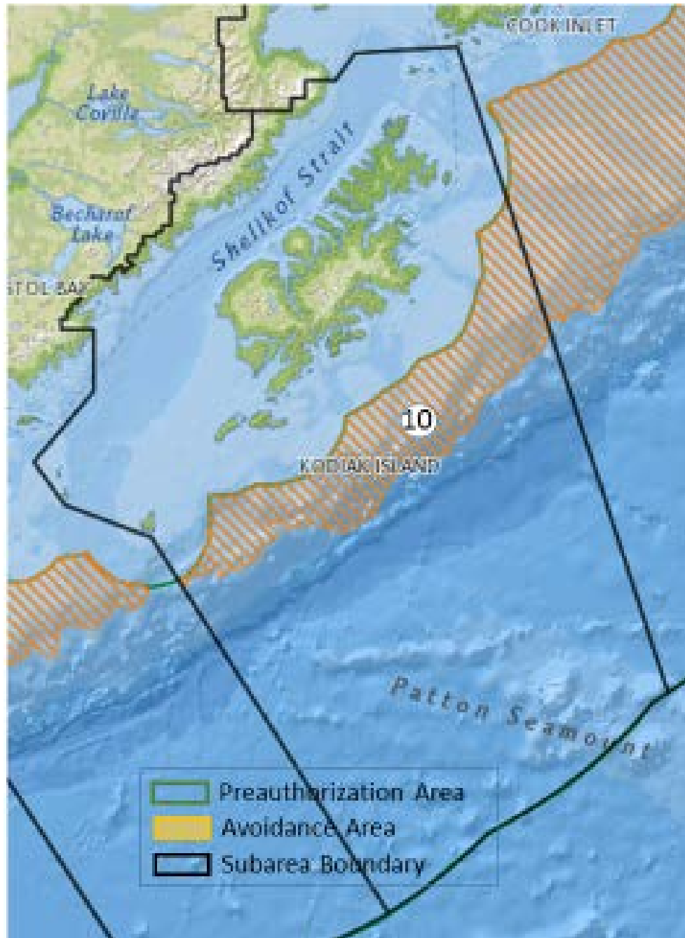
Figure 1-3 – The dispersant use avoidance area in the Kodiak Subarea was primarily delineated based on the presence of North Pacific right whale critical habitat and Biologically Important Areas, Habitat Areas of Particular Concern, abundant commercial fishing resources, physical oceanography features, hydrographic flow patterns, seasonally important primary productivity, and areas of public concern.