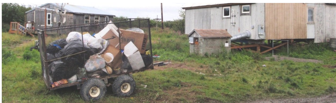
Neighborhood waste collection container.