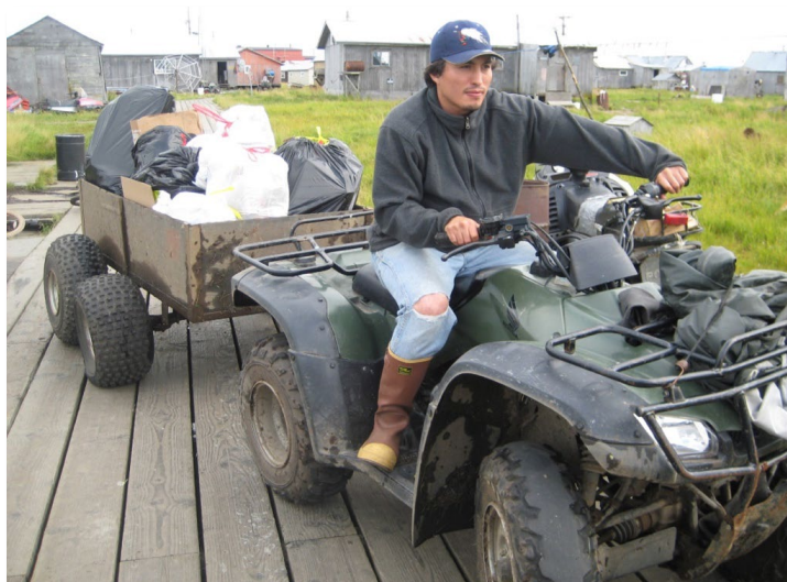
Residential waste collection program.