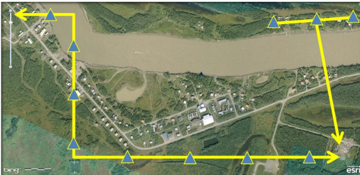
Landfill trips in a community with a collection program.