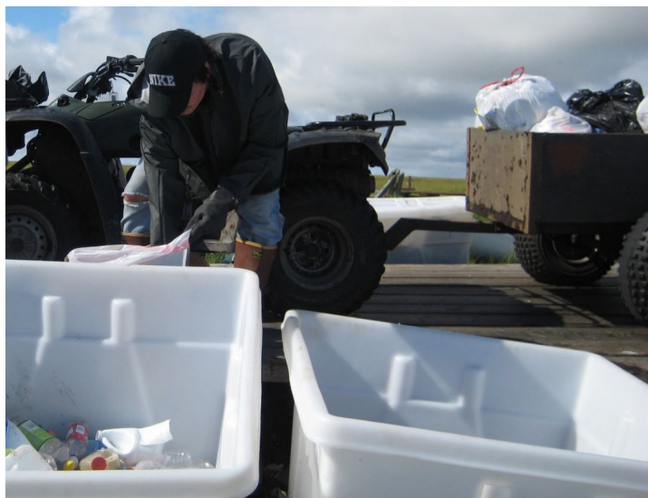
Residential waste collection program.