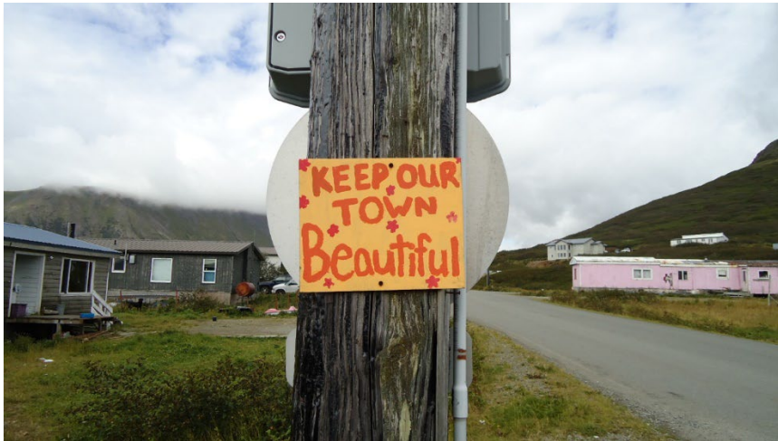
Outreach signs promoting litter prevention and proper waste management within the community.