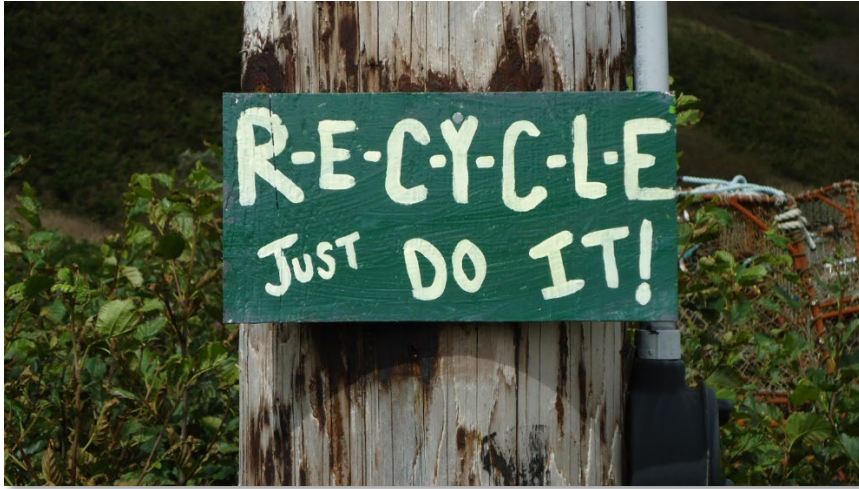
Signs for recycling outreach in the community.