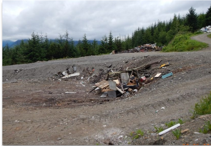
Working face at an area fill.

The landfill working face is the area where sorted waste is placed for final compaction and permanent disposal. There can be different working faces across the landfill for different types of waste. For example, a landfill could have a working face for household waste and a working face for construction and demolition debris.