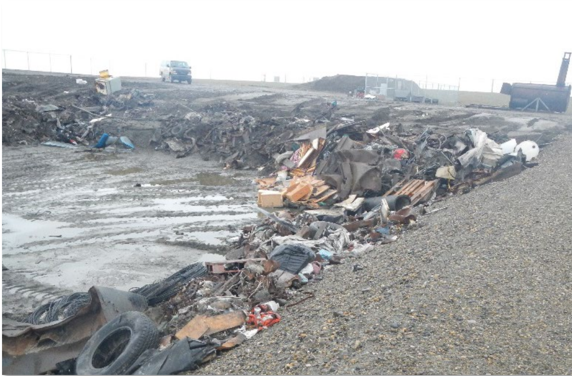
Working face at an area fill landfill.