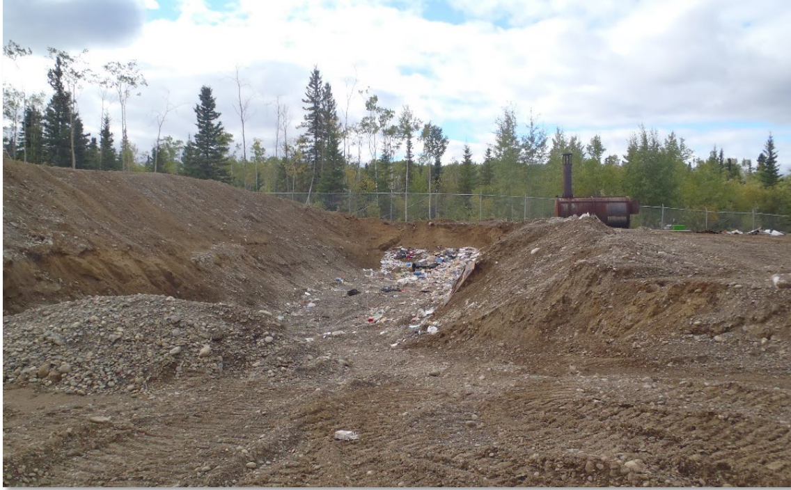
Trench-and-fill working face.