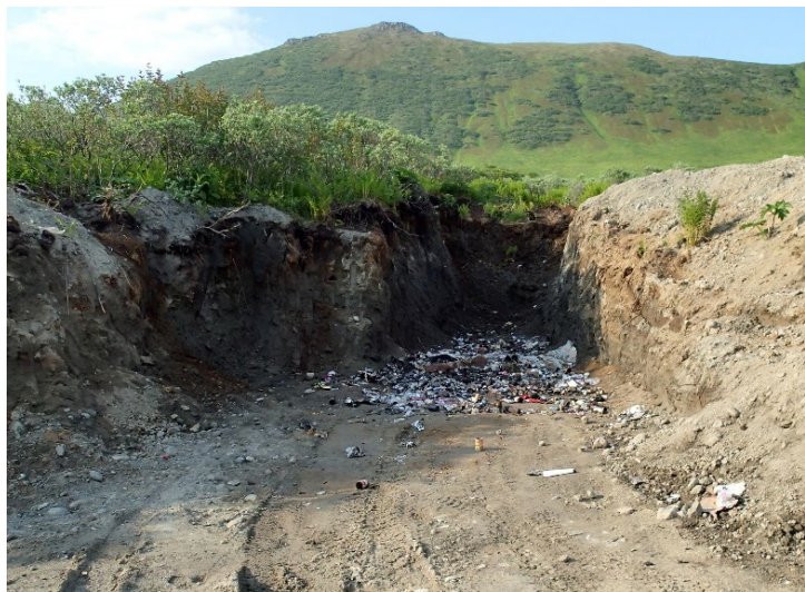
Working face at a trench-and-fill landfill.

The working face must be kept as small as possible. Ideally, the working face in an area fill shouldn't be any wider than 50 feet as this helps reduce litter and other issues with waste. A small working face also requires less cover material. In a trench-and-fill, the working face should be kept to one end of the trench and should be compacted and covered often.