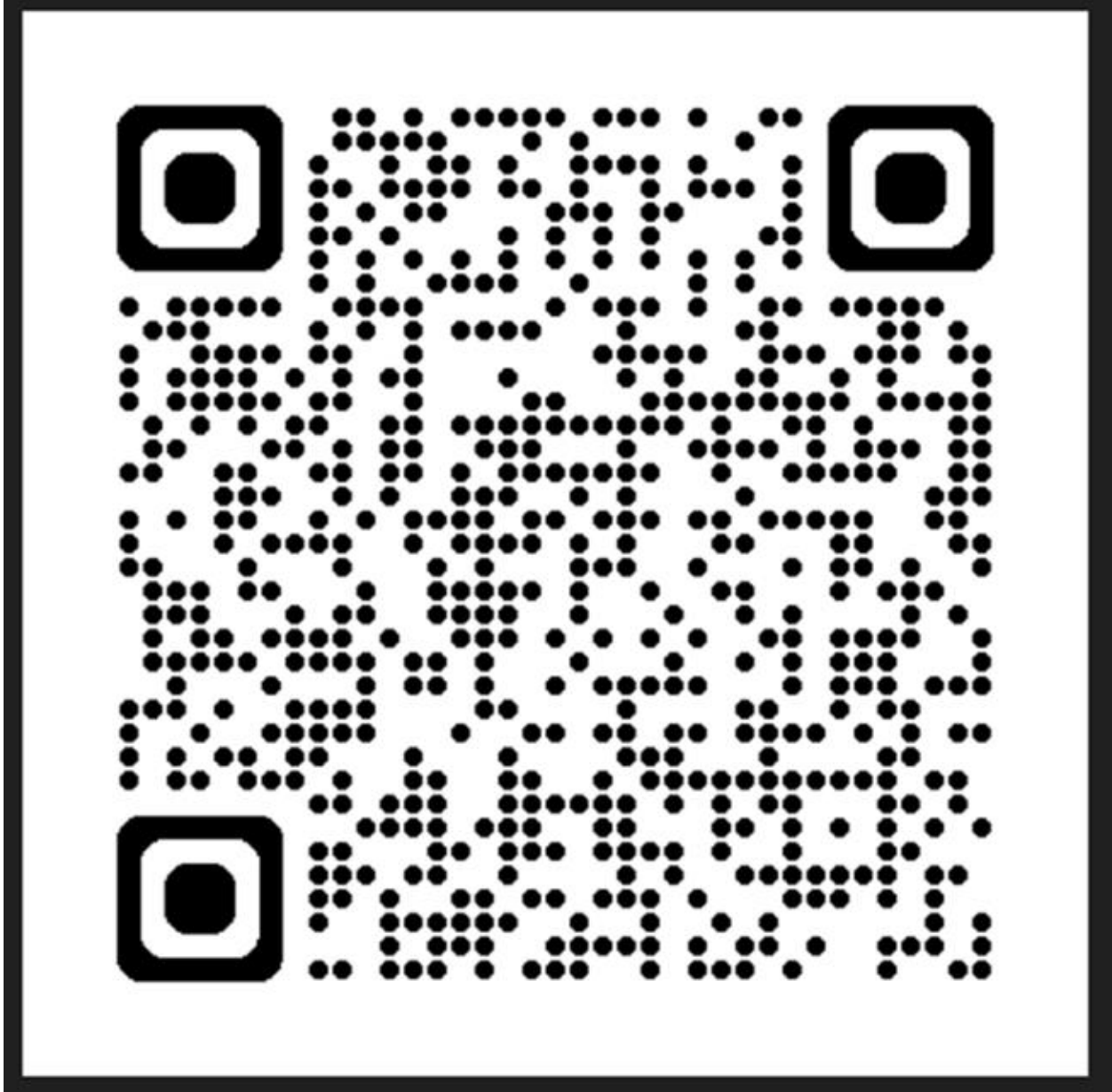
This is the QR code to sign up for the GRS subcommittee