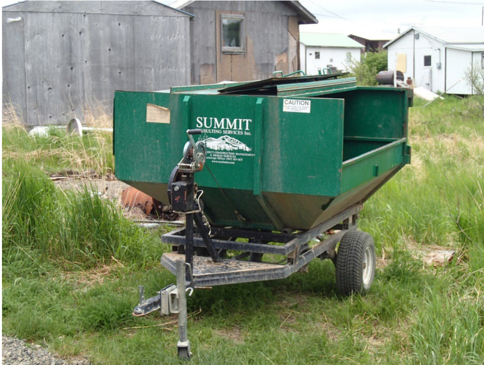
Collection bin that closes to prevent wildlife access.