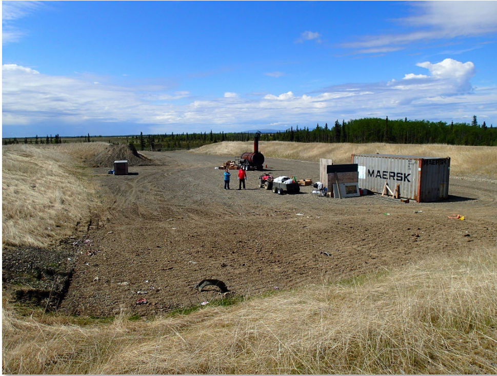
Well-managed landfill that is not likely to attract wildlife.