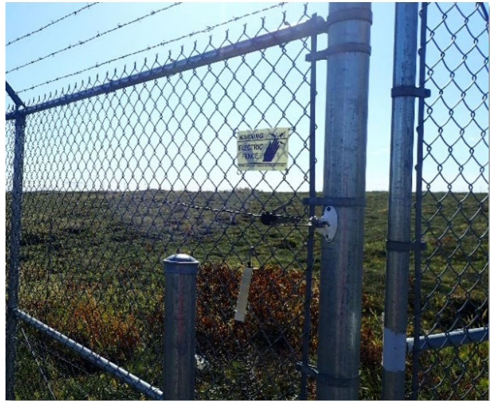
Electric fence to keep bears out of the landfill.