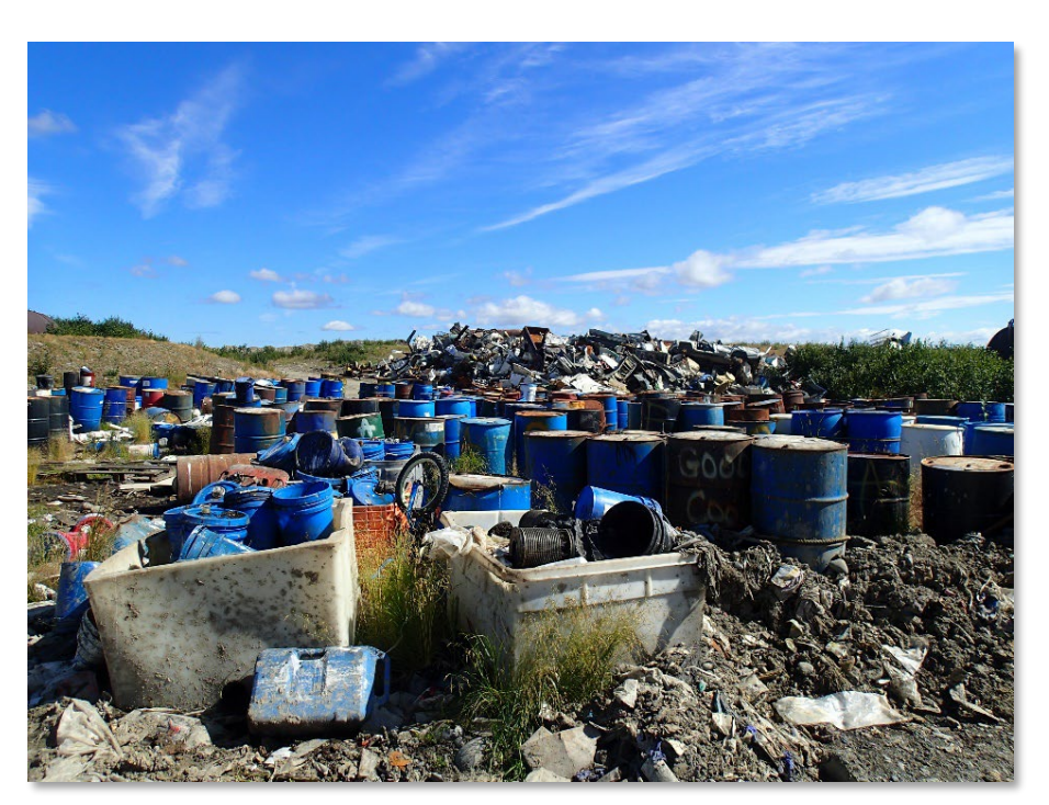
Large collection of unlabeled drums at the landfill. It is not clear which ones may have liquid and which ones do not contain liquid.