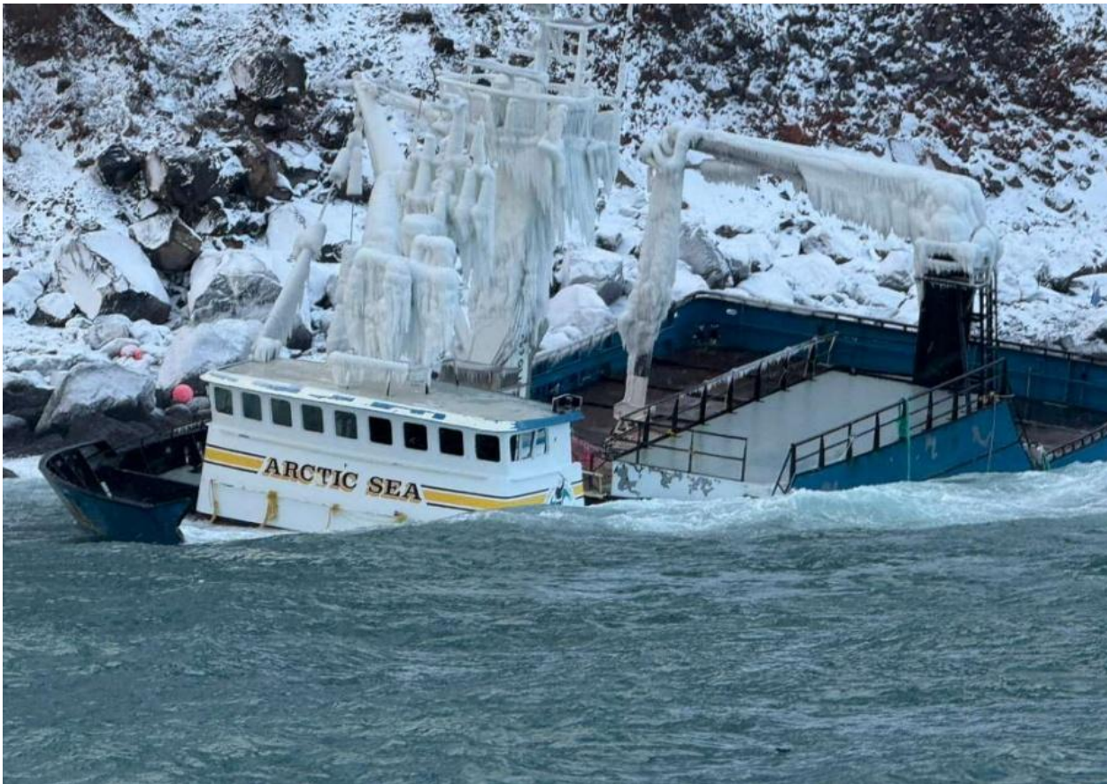
The F/V Arctic Sea as seen from work boat. January 12, 2026.