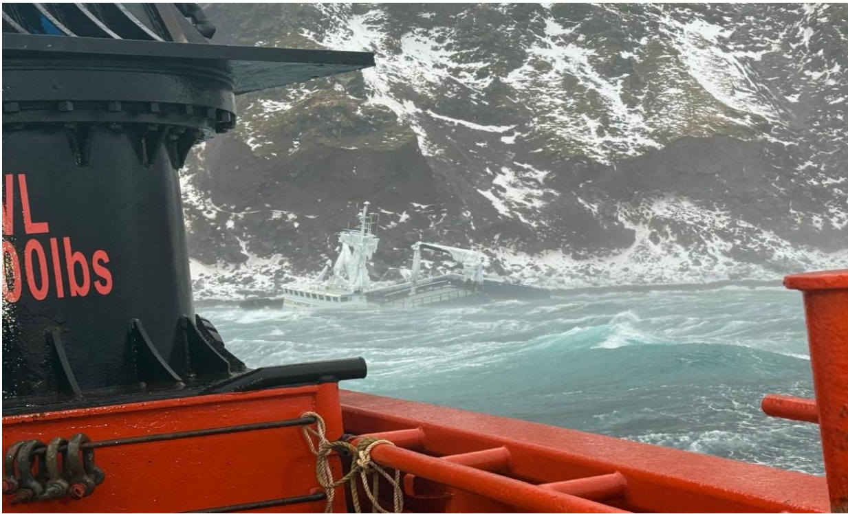
The F/V Arctic Sea as seen by work boat January 16, 2026.