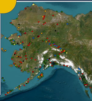
Contaminated ANCSA Sites Common Operating Picture; EPA, ESRI

There are over 1,200 contaminated sites across ANCSA lands that were contaminated before conveyance. These sites need to be identified, inventoried, and characterized. The Alaska Department of Environmental Conservation (DEC) will assist with these efforts.