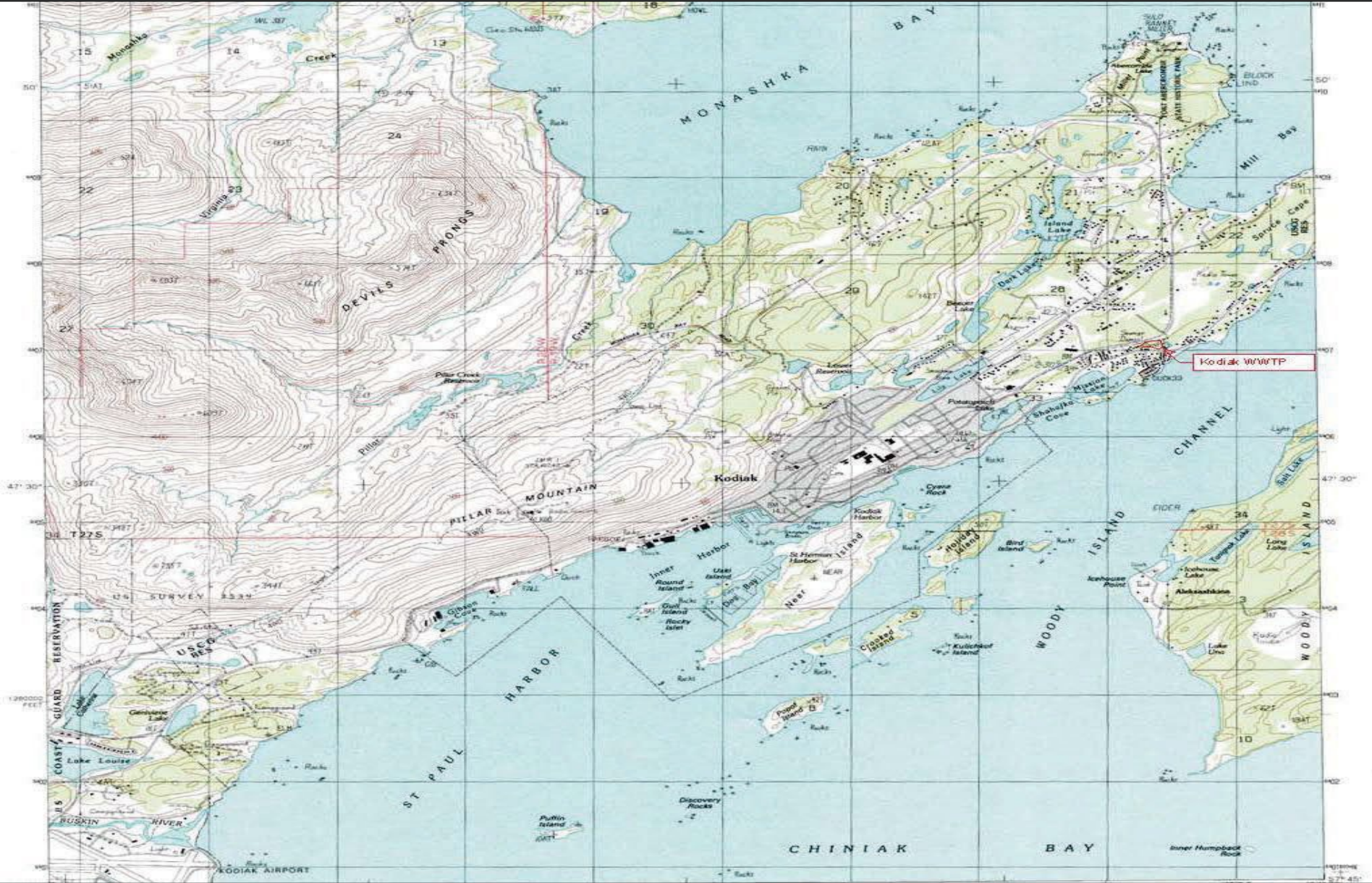
Figure 1- City of Kodiak WWTF Location