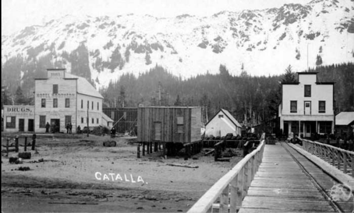
Anchorage Museum of History & Art. Library & Archives.