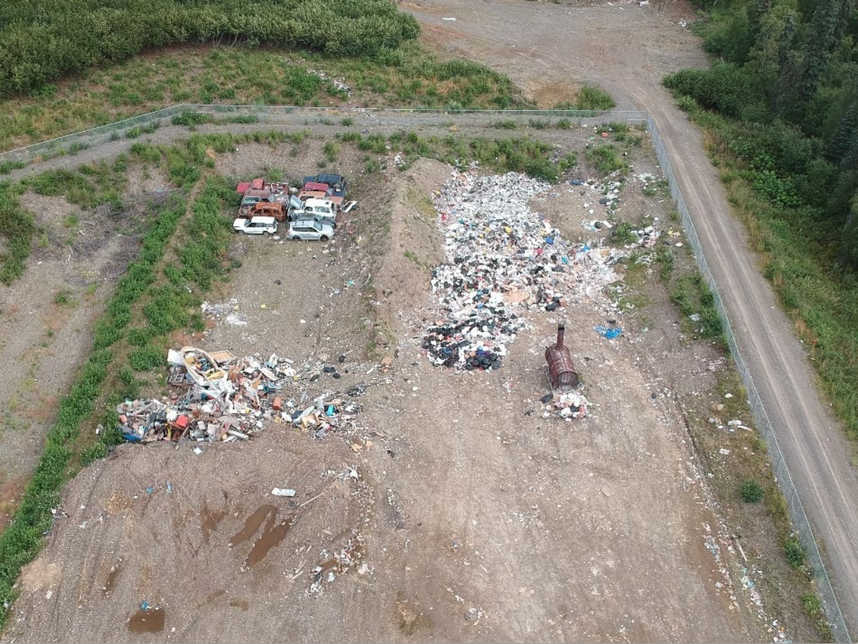
Area fill landfill with the household waste consolidated behind the burn unit. The waste on the left side is construction and demolition debris.