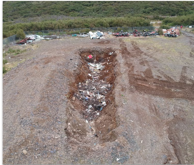
Trench-and-Fill landfill. All the waste is consolidated into one half of the trench. Notice that the waste is not spread across the site.

The opposite of waste consolidation is having waste spread over the entire landfill site. This makes it difficult for users to safely dispose of waste and for operators to manage the waste. The best way to combat this issue is to control access to the landfill, keep a landfill operator on site during open hours, and use signage to direct users to the proper working face and storage areas.