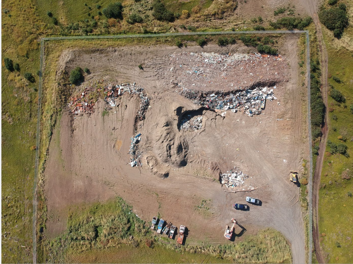
Area fill landfill with two separate working faces demonstrating excellent consolidation. The household garbage working face is near where the cars are parked, allowing easy drop off by the public. The larger working face towards the back of the landfill is for metals.