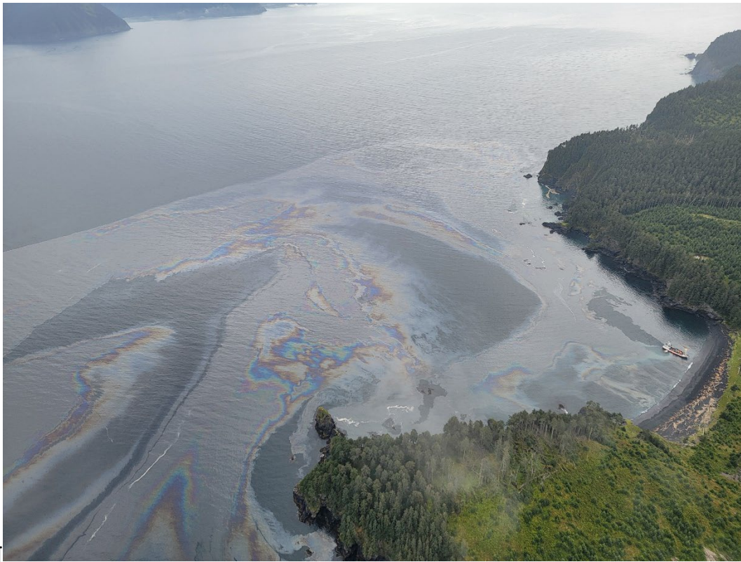
Photo: Izhut Bay, September 2, 2025.

AGENCY/STAKEHOLDER NOTIFICATION LIST: This situation report was distributed to the agencies listed on the standard distribution list, which includes the governor's office, State Emergency Operations Center, U.S. Department of the Interior, National Marine Fisheries Service, U.S. Fish and Wildlife Service, and other state agencies. This situation report was also distributed to the following agencies and stakeholders: