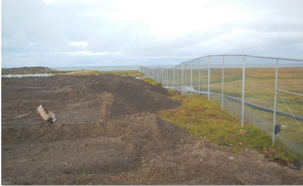
Waste recently covered.