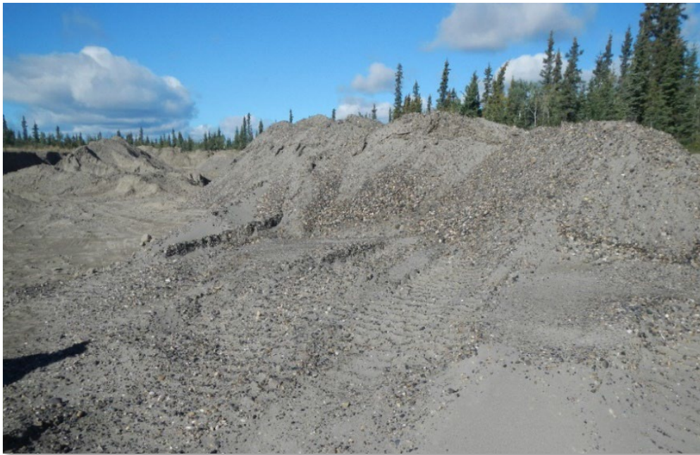
Stockpiled cover material.