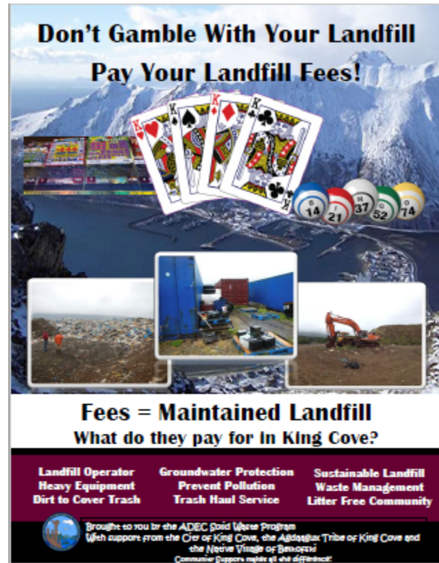
Flyer in King Cove to encourage people to pay their landfill fees.