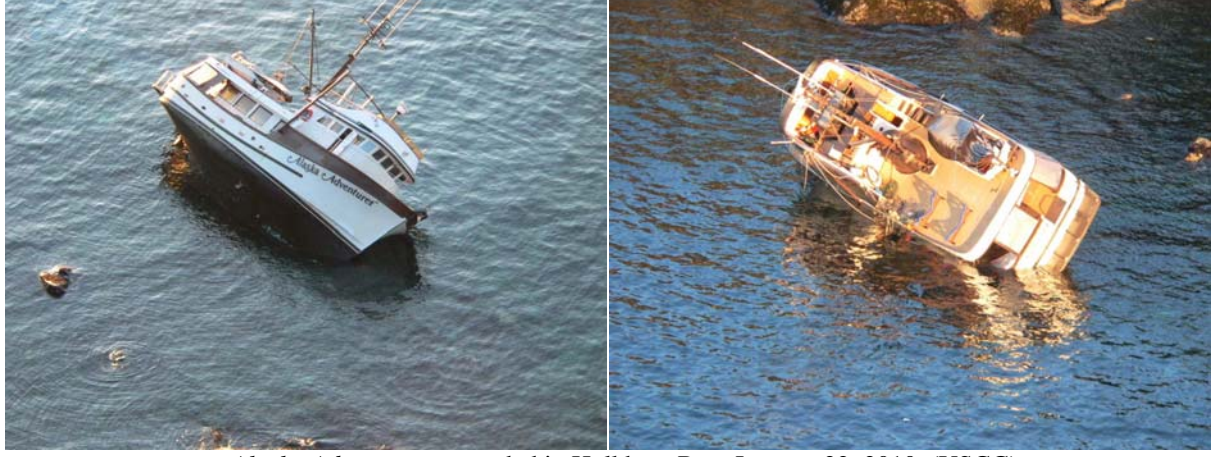
Alaska Adventurer grounded in Holkham Bay, January 22, 2010.