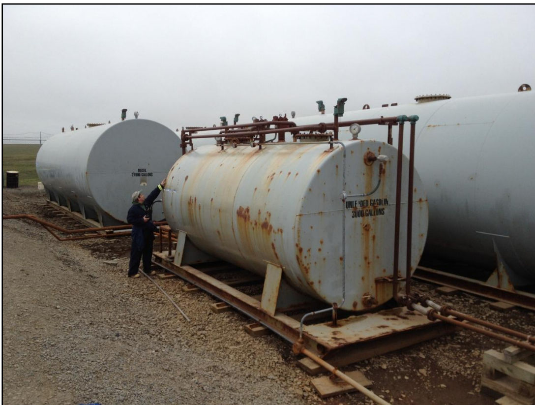
July 19, 2012: Wes Ghormley (ADEC) inspecting day tank which overflow caused the incident