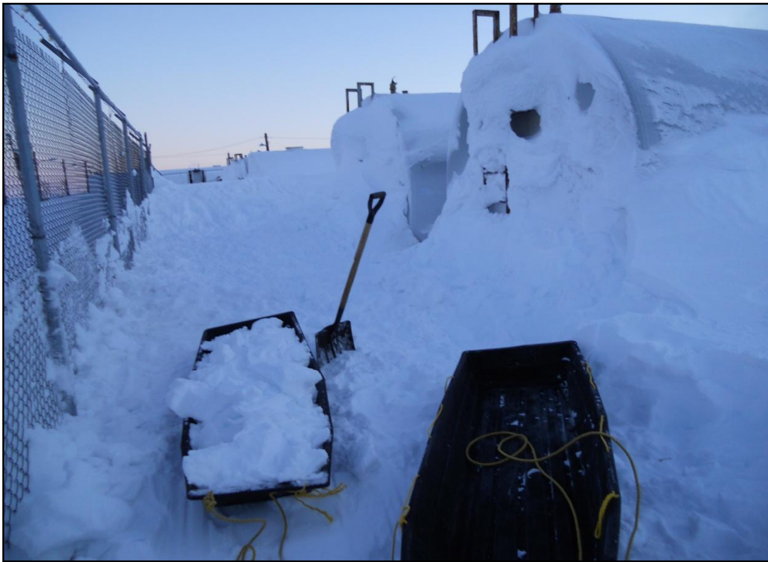
January, 2012: Response equipment used to remove uncontaminated snow from the tank farm