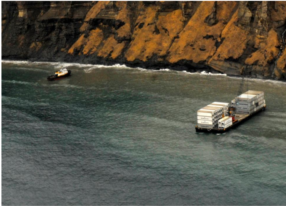
The tug Polar Wind and barge Unimak Trader grounded 40 miles east of Cold Bay, Alaska, Nov. 14, 2012.