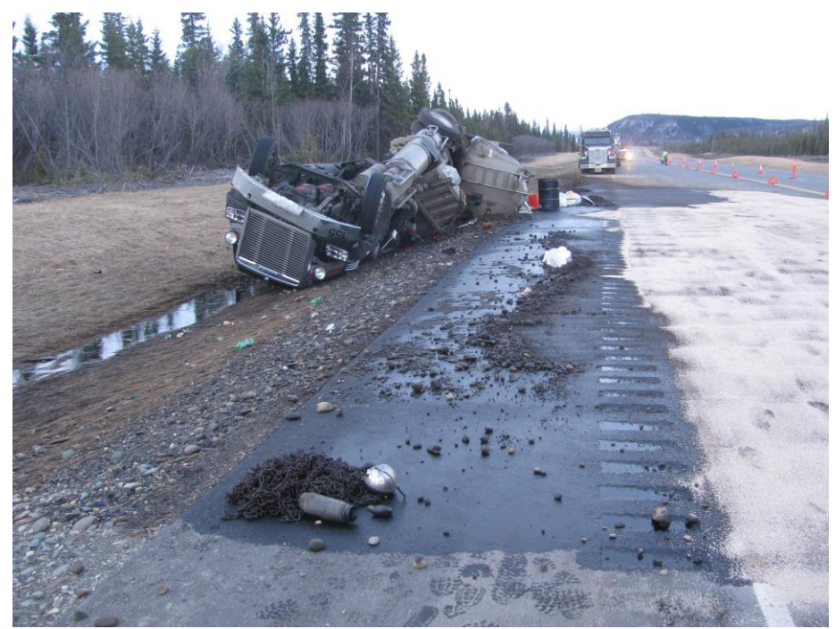
Figure 1. Tanker trailer rolled over along the roadway. Unaffected pup trailer not visible.