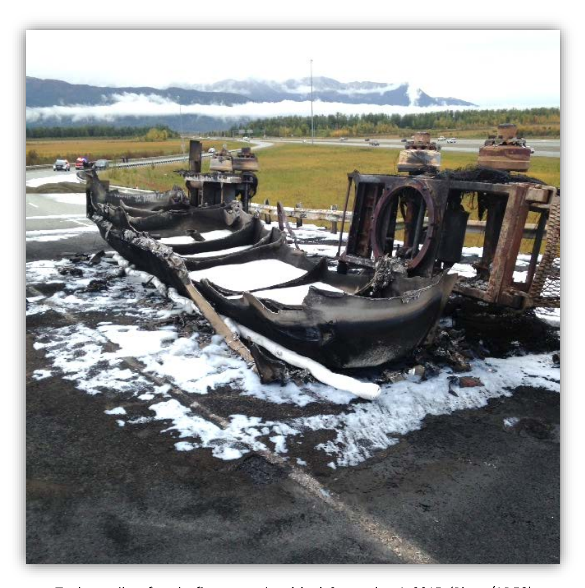
Tanker trailer after the fire was extinguished, September 4, 2015.

http://dec.alaska.gov/spar/ppr/response/sr_active.htm